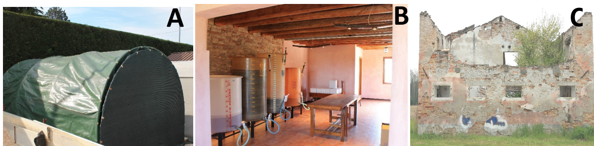
Fig. 1. Farm equipment shed (A), point of sale in farm wine cellar (B) and ruined farmhouse building (C)