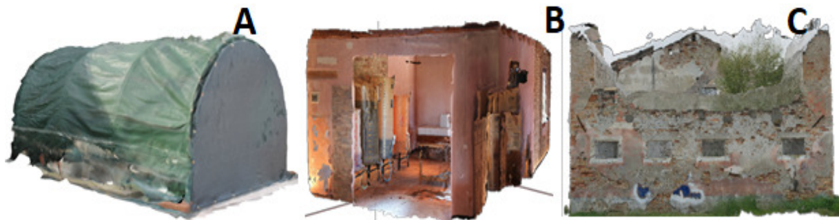
Fig. 3. Example of frame collection process respectively for farm equipment shed (A), point of sale in farm wine cellar (B) and ruined farmhouse building (C)